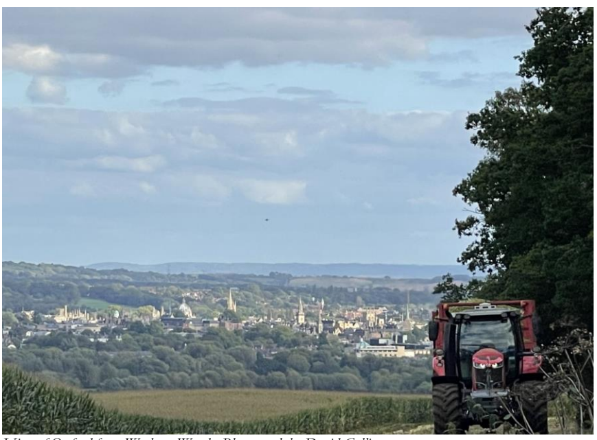
View of Oxford from Wytham Woods.