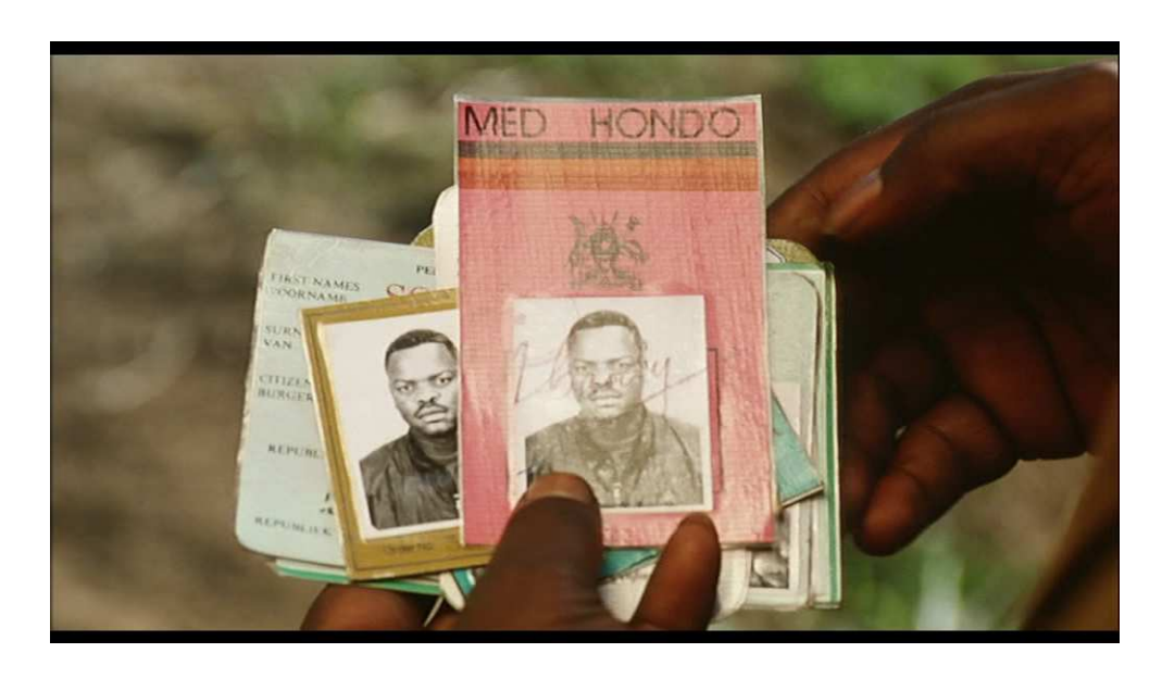
Screen shot from Jean-Pierre Bekolo's film "Aristotle's plot" 1995