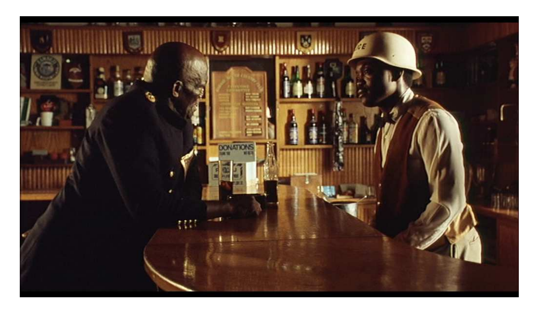
Screen shot from Jean-Pierre Bekolo's film "Aristotle's plot" 1995