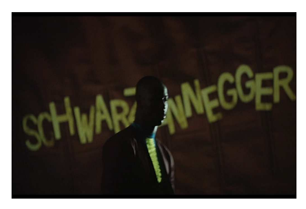
Screen shot from Jean-Pierre Bekolo's film "Aristotle's plot" 1995

Documenta 14 in Athens and Kassel has demonstrated not only single artworks, but the whole exhibition trying to become a composite-cultural expression, while defying the commodification of artworks and providing postcolonial perspectives. An exhibition such as documenta 14 is Afropolitan in the sense of being an affirmative partition which keeps together/apart so many different aesthetic statements and such a variety of culturally different expressions that it becomes impossible to synthesise the artworks into a coherent aesthetic or epistemological statement. It may be read as a concentrated and affirmed expression of aesthetic dividuations due to the heterogeneity of the assembled artistic articulations, of their aesthetic interferences with each other and of the tensions arising between them. Giant composite-cultural shows of this kind bring about new problems, namely the question of how to find an aesthetic compromise between the particular cultural compositions and a coherent expression of the whole exhibition, with the intention of intensifying the expression of being/together apart, the interlocking of here and elsewhere and so on.