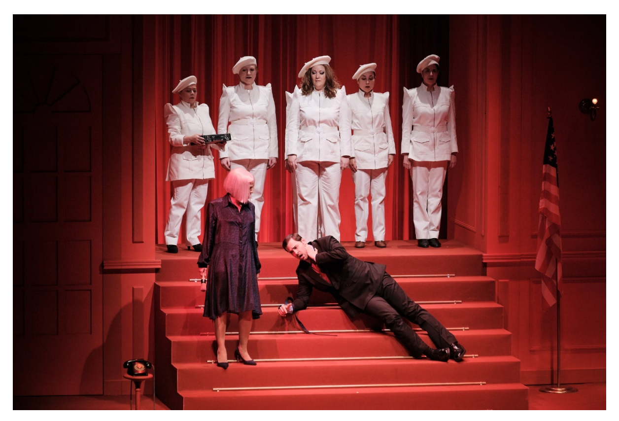
Figure 2. A Amnesia de Clío, opera by Fernando Buide

I propose that the coincidence of factors deemed sufficient by Jauss—the horizon of expectation, which is the primary code implicit in the work; and the horizon of experience, which is the secondary code supplied by the recipient—be subjected to the self-interrogation criterion, i.e. opening up the historical depth of the present itself, in order to unveil what the work is in reality, which, as argued by the German philosopher, is part of the self-understanding of the contemporary subject beyond the forms of the path of history.