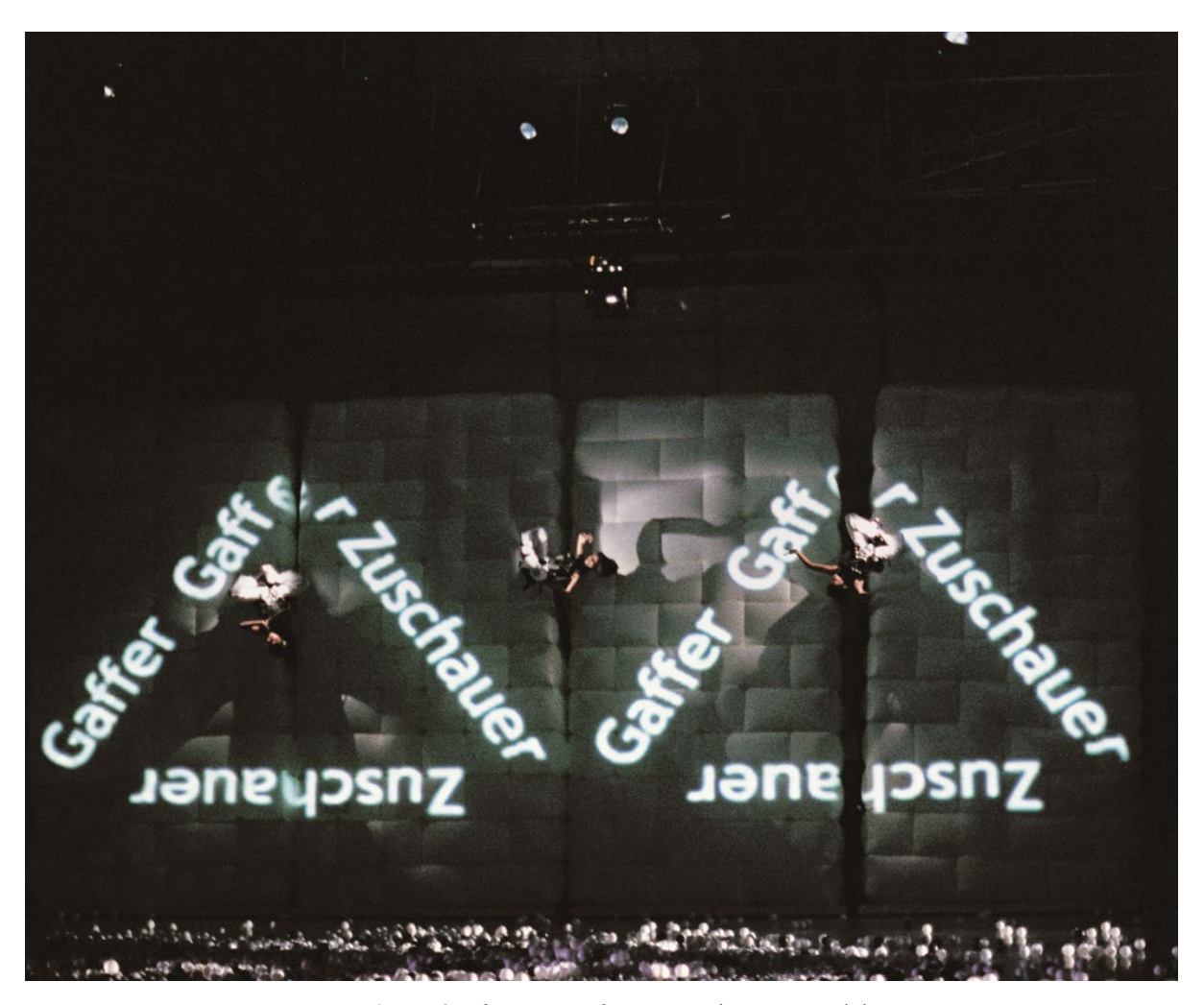
Figure 3. The Magic Flute, Opera by La Fura dels Baus