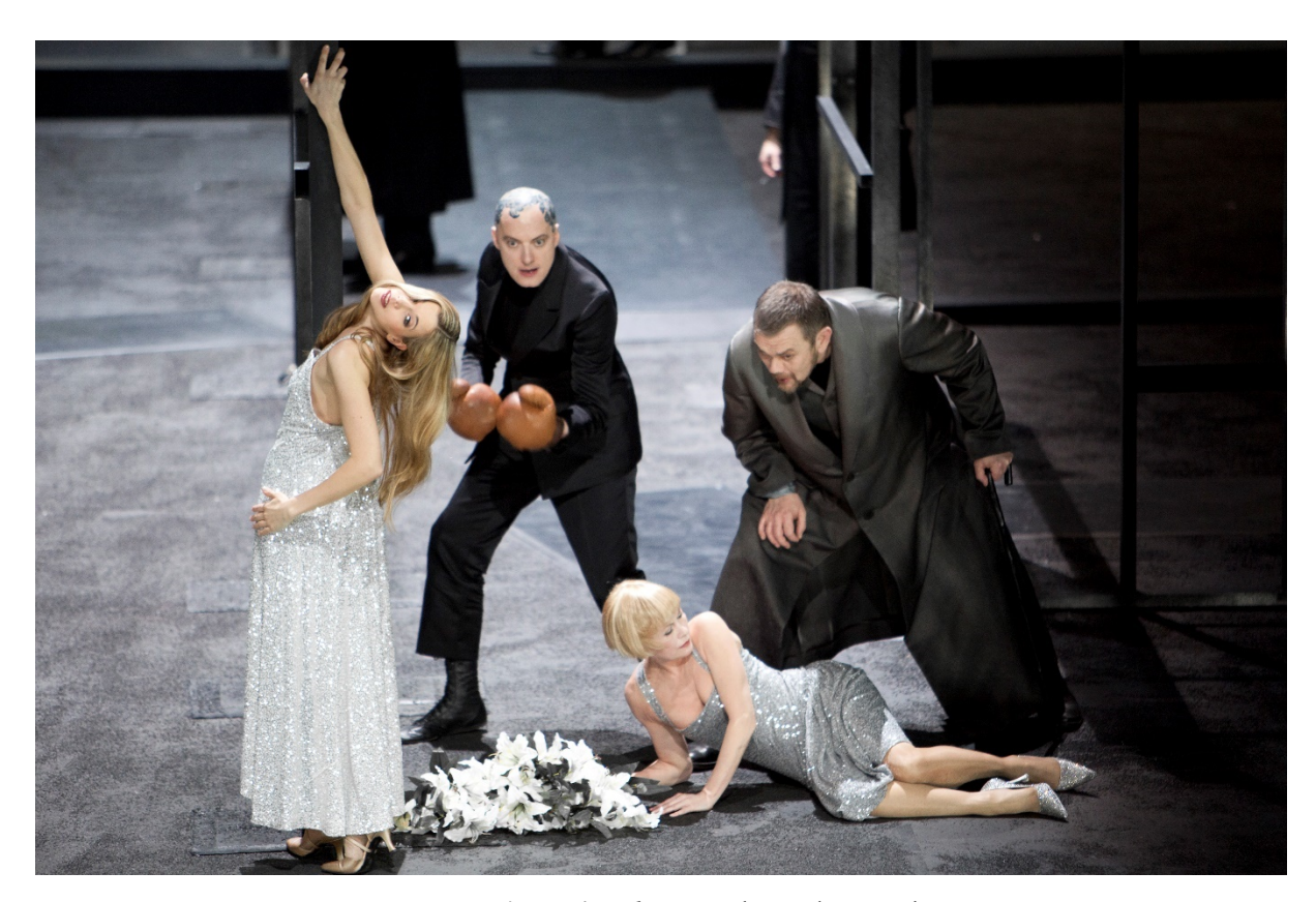
Figure 4. Lulu, Opera by Andrea Breth

possibilities that the work would open up.