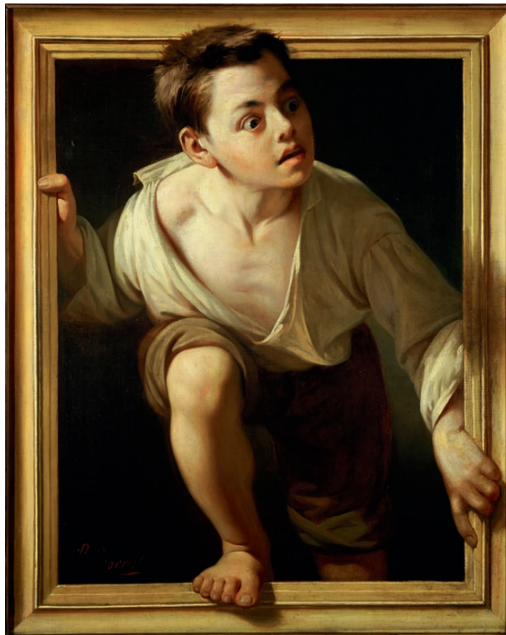
FIGURE 4. Pere Borrell del Caso, Escaping Criticism , 1874, Banco de España, Madrid.

In this case, as to the whole scene we knowingly illusorily see in our picture perception, we (knowingly illusorily) see the open window as being a bit further behind the location where the picture's vehicle is and is knowingly veridically seen to be, the flowers as being a bit more further behind, and the houses belonging to this Italian village as being even further behind; yet the curtains are seen as being precisely where the picture's vehicle is and is knowingly veridically seen to be. The second option (admittedly rarer than the first one) – progressive regression, colocation and progressive protrusion – is given for example in this famous picture by Pere Borrell del Caso, Escaping Criticism [FIGURE 4].