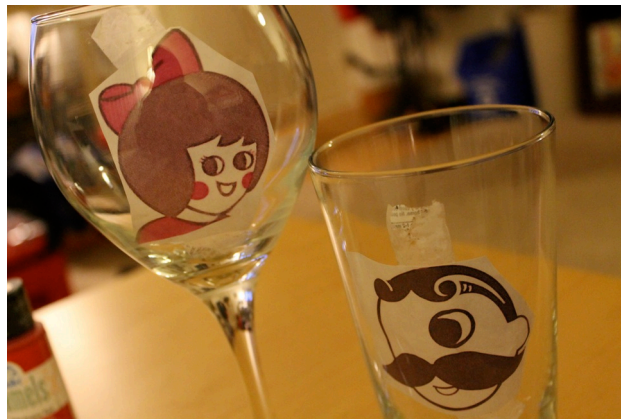
FIGURE 5. Anonymous, Two Glasses , http://itsokayweresisters.wordpress.com .

A third case phenomenologically problematic for the transparency account obtains when an ordinary perception of transparency somehow interacts with a picture perception. This situation occurs when a transparent layer is also a picture of a subject different from its background object, as in this case of glasses that present human silhouettes different from the portions of the table that are respectively seen through the glasses themselves [FIGURE 5].