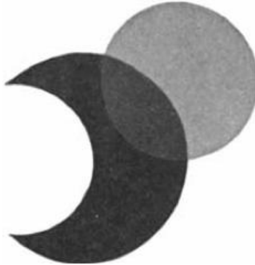
FIGURE 2. Fabio Matelli, Crescent and Circle , Scientific American, vol. 230, 1974.

Now, comments Newall, this also happens with many pictures: when we perceive them, we experience a scission in the visible properties of its vehicle that are still ascribed to that vehicle and those that are ascribed to its subject. E.g. if you have a sepia photograph, it is seen as having a blend of yellowish tones that are splitted in tonal properties that are ascribed to its subject and in yellow hues that are still ascribed to the photographic vehicle itself. Mutatis mutandis , the same happens with glossy photographs. 8