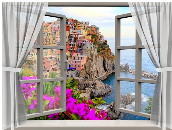
FIGURE 3. Anonymous, Window with Sea View .

The first option – progressive recession and colocation – is given for example in the following picture presenting an Italian village [FIGURE 3].